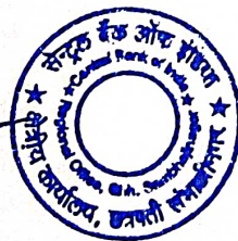
ASST. GENERAL MANAGER