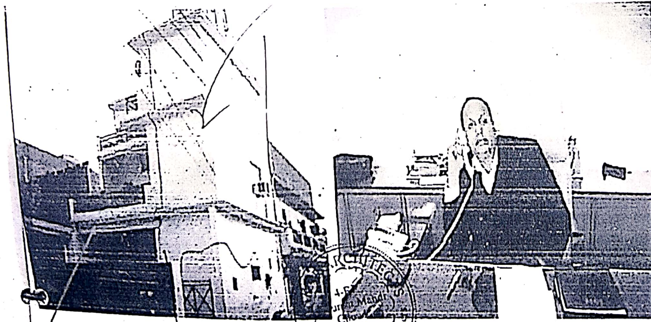
Photographs of site -As per site taken by us

RCIT/REG 4-R J.P. Mandi Chowk Ludhiana. Consultants Planner Valuer